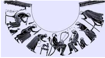
Picture 4: Music Lesson, Greek Pottery Painting British Museum 500 to 450 B.C.