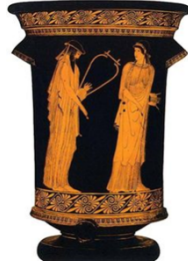
Picture 3: Athenian depiction of Sappho and Alcaeus, about 450 B.C.E.

According to an inscription in Teos, choir vocals among the female students having signing lessons were known to singing hymns in national and religious ceremonies led by Paidonomos (Dittenberger,1982:234).Choir was led by Khorodidaskalos ( Choir Teacher/Instructor ). Female students were known to having dance lessons as well as singing lessons in 2 nd century B.C. in Magnesia of Meander (Dittenberger, 1982:695). Plato, who was trying to protect some aspects of classical education in 4 th century B.C stressed that the students getting music education should be provided with education of three years to understand sounds and complexity of Lyra. According to Plato, singing was a kind of poem. Instrumental section was thought to be a free part in accordance with the pleasure of interpreter and Plato thought that this was highly difficult for a beginner student. However, Aristoteles put an emphasis on the emotion and experimentation in music education. He suggested this point of view as a response to Pythagoras. The terms such as educated musicians and uneducated musicians were used to separate students from one another.