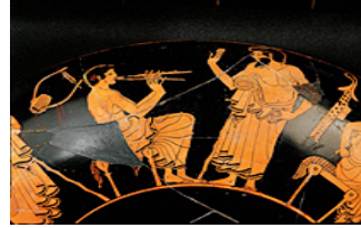
Picture 5: Music lesson, a pupil learns to play the aulos-flute. Red-figured cup, Attic, early 5th BCE